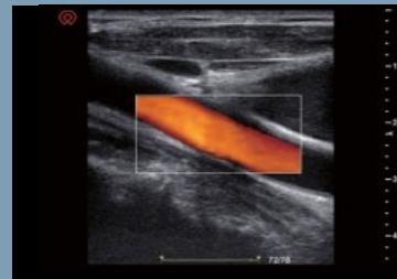
Lower Extremity Artery