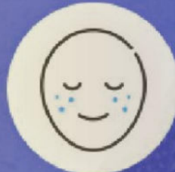
Freckle, Lentigines, Cafe-au-lait Spot, Becker's-Nevus, Age spot Improvement