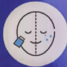
Nevus of Ota & ABNOM Removal