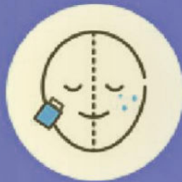
Melasma & PIH Improvement