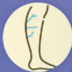
Vascular Vain Treatment