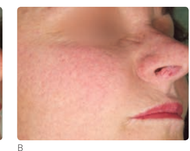
Nd:YAG Laser (Photos using polarized light).