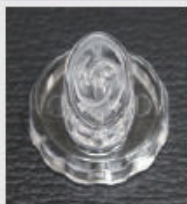
Around the nose

The special tip of the Hydro Queen™ consists of two suction holes and one serum sidcharge hole. Its specially-designed spiral tip is intended to hold a product long enough to soften dead cells of the scalp and skin, provide nutrients, and absorb them in a vacuum state to maximize its peeling and extrusion effects.