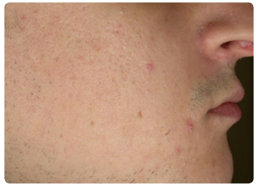
Acne scars treated with Insight Nd:YAP laser handpiece.