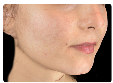
Active acne treated with Lazur PL handpiece. Photos taken using QUANTIFICARE 3D software .