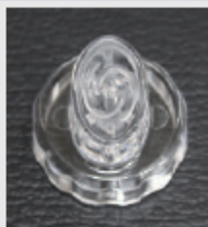
Around the nose

The special tip of the Hydro Queen™ consists of two suction holes and one serum sidcharge hole. Its specially-designed spiral tip is intended to hold a product long enough to soften dead cells of the scalp and skin, provide nutrients, and absorb them in a vacuum state to maximize its peeling and extrusion effects.